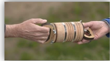
Picture 1 - Relay baton

The Challenges Foundation also launched the sustainable relay baton (Picture 1). The relay baton is a physical wooden object passed from one sustainable project in Nijmegen to another. The concept of a relay baton was passed to the province of Gelderland, being passed on to the entire province. In addition, the relay baton received an international character as Nijmegen asked Essen to put all its stories into the relay baton. Nijmegen added its own stories and passed the relay baton to Oslo.