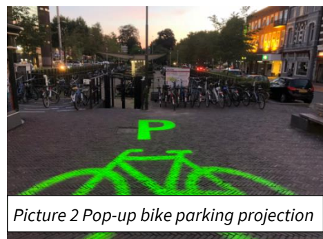
Picture 2 Pop-up bike parking projection

A last example is the national Cargo Bike Festival, which is now spreading towards Berlin and another Dutch city called Groningen.